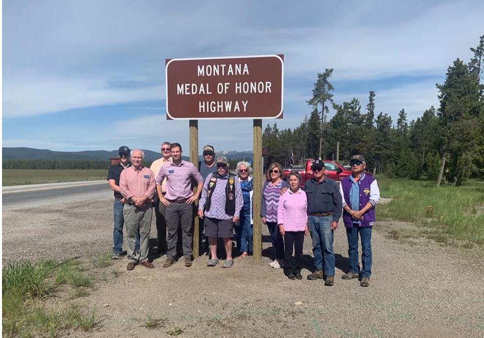
MONTANA MEDAL OF HONOR HIGHWAY SIGN