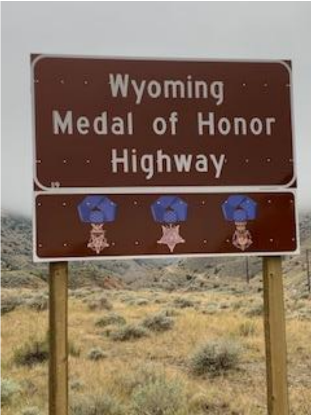
WYOMING MEDAL OF HONOR HIGHWAY SIGN