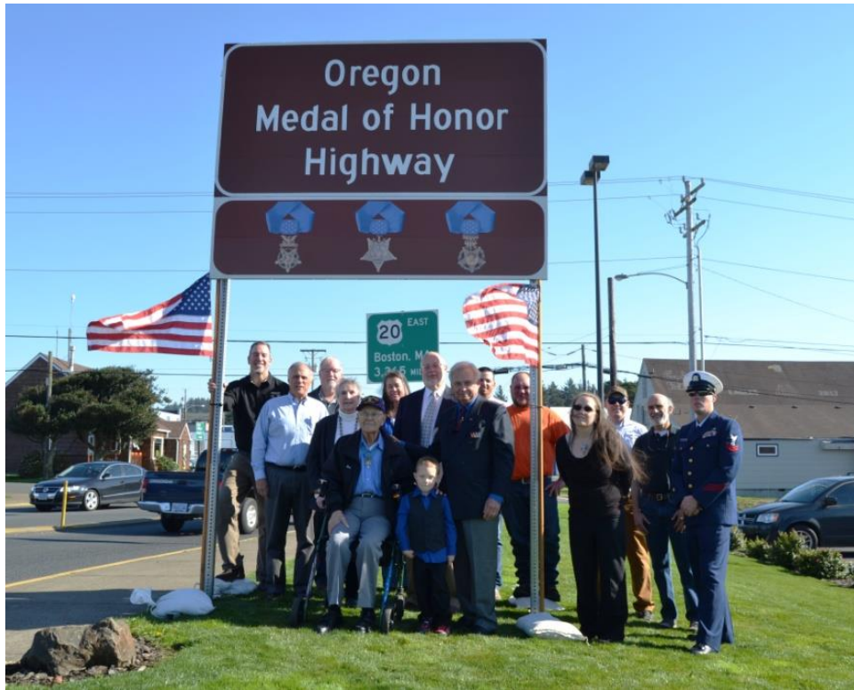
OREGON MEDAL OF HONOR HIGHWAY SIGN