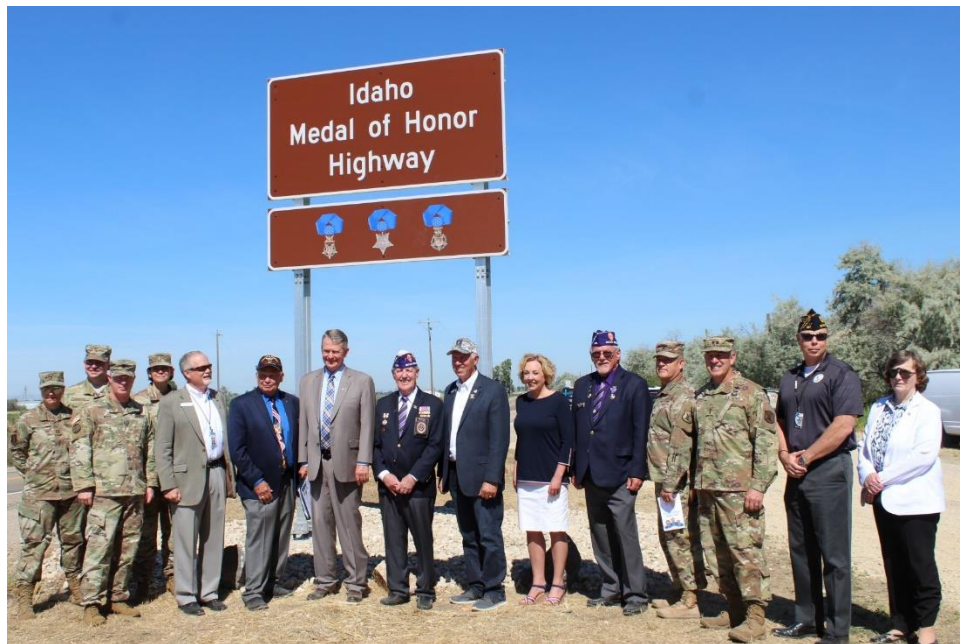
IDAHO MEDAL OF HONOR HIGHWAY SIGN